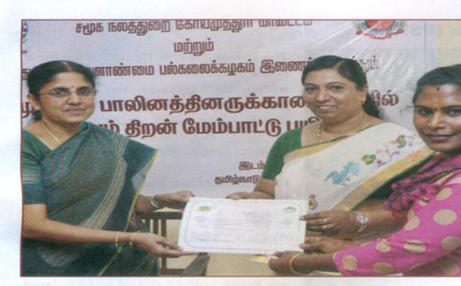
Certificates givin to Third Gender after completion of Training

The Third Genders are the most marginalized communities who are often rejected and thrown out of their homes by their own families. They go through abuse, deprivation and other forms of discrimination.